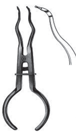
2412 BREWER 175 mm