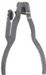
2418 "IV" Type Rubber Dam Punch 160 mm