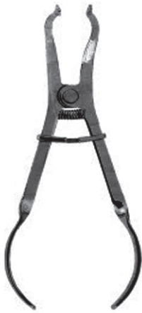
2410 IVORY Light weight, 170 mm