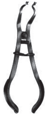
2414 IVORY 170 mm