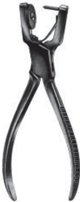
2415 AINSWORTH Rubber Dam Punch 170 mm