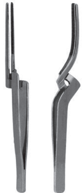
2421 MILLER Articulating Forceps 15 cm