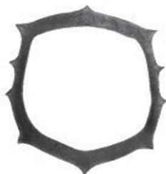
2419 Plastic Rubber Dam Frame 242