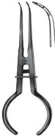
2411 BREWER 175 mm