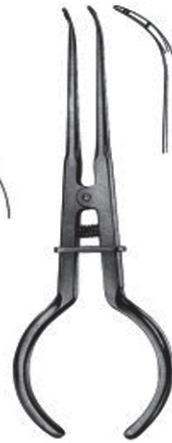
2413 WHITE 175 mm