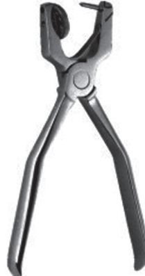
2417 AINSWORTH Rubber Dam Punch 170 mm