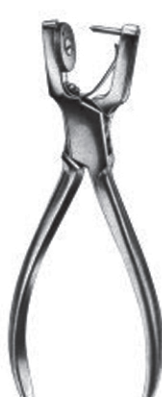
2416 AINSWORTH Ainsworth Rubber Dam Punch 170 mm