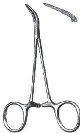
2570 HALSTED-MOSQUITO Jaws 45 Angled on Flat, 5" Extra Delicate