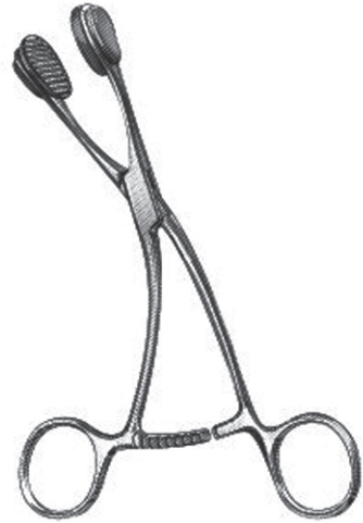
2560 ALLIS 6", Straight 4x5 teeth extra delicate