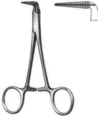
2546 Endo Forceps 4 3/4"