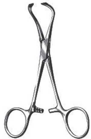
2575 LORNA Non Perforated 3 1/2"