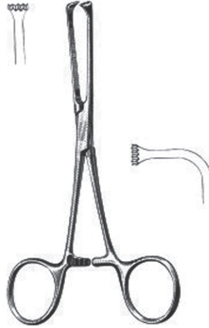
2559 ALLIS 6", Straight 4x5 teeth extra delicate