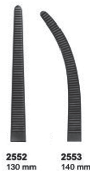
2552 130 mm