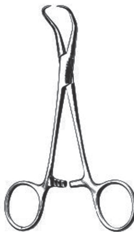
2574 BACKHAUS 5 1/4"