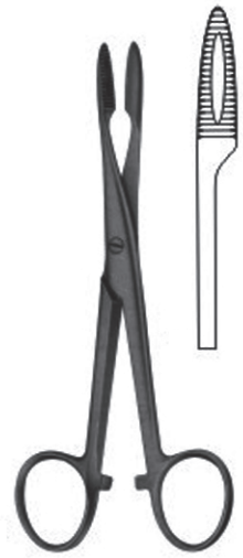
2549 With Ratchet 145 mm