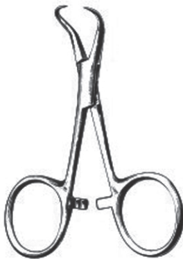
2573 BACKHAUS 3 1/2"