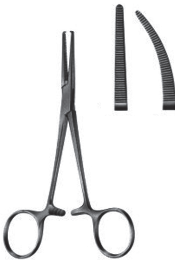
2550 CRILE 140 mm