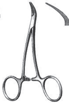
2547 PEETS Forceps 4 3/4", Useful For Removing Broken Instruments