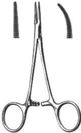
2568 HALSTED-MOSQUITO Straight, Curved, 5"