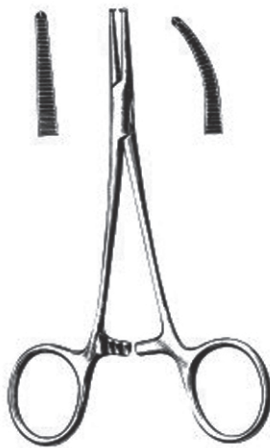
2569 HALSTED-MOSQUITO Straight, Curved, 5" 1x2 teeth