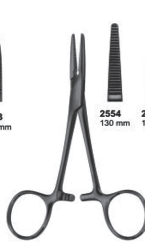
2554 130 mm