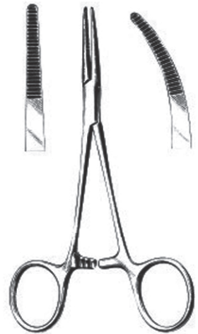
2571 KELLY 5 1/2", Straight