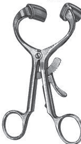
2588 MOLT Adult