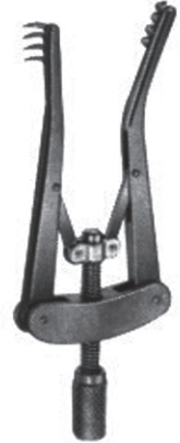
2625 ALM 70 mm