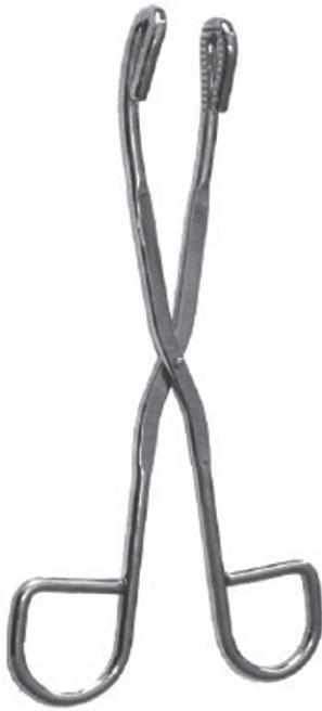
2615 Sterilizing Forcep Curved 20 cm A 25 cm B 30 cm C