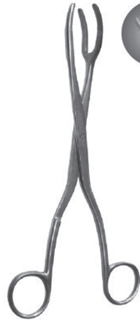
2617 Sterilizing Forcep 30 cm