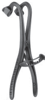
2577 DENHARDT Mouth Gag With Silicon Inserts, Interchangeable Size: 125 mm