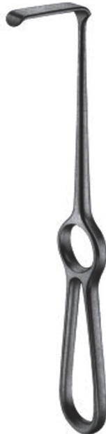
2605 KOCHER-LANGENBECK 215 mm