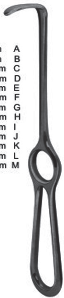
2604 LANGENBECK 210 mm

30 x 4 mm A 23 x 7 mm B 24 x 11 mm C 29 x 10 mm D 30 x 11 mm E 32 x 14 mm F 40 x 11 mm G 42 x 10 mm H 50 x 11 mm I 55 x 11 mm J 60 x 11 mm K 70 x 11 mm L 70 x 14 mm M