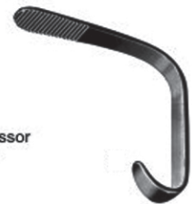
2582 ANDREW Tongue depressor Size: 110 mm