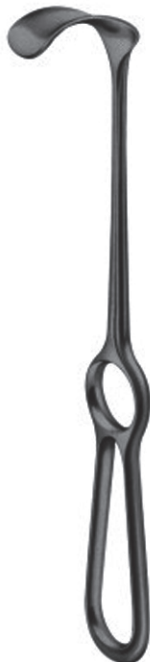
2612 KOCHER 230 mm