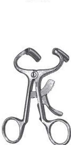
2586 MOLT Pediatric