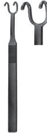
2624 FOMON 145 mm