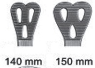
140 mm 150 mm