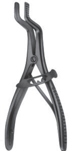
2590 ROSER KOENIG Mouth Gag Size: 160mm / 185mm