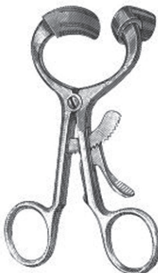
2587 MOLT Child