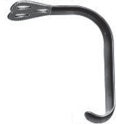
2578 WIEDER Tongue depressor 2579 140mm 2580 150mm