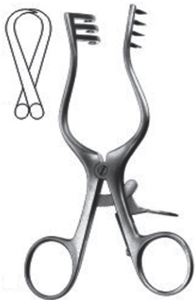
2583 WEITLANER Sharp 130 mm