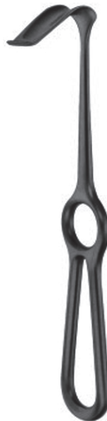
2606 BUCHS 205 mm