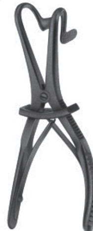
2589 FERGUSON-ACKLAND Mouth Gag Size: 145 mm