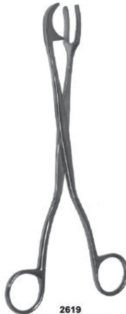
2619 Sterilizing Forcep 23 cm A 30 cm B