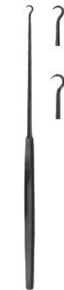
2629 GILLIES 180 mm