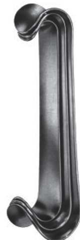
2614 ROUX Set 165 mm