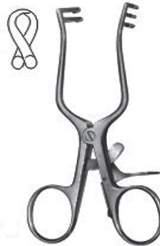
2585 WEITLANER Semi-Sharp 110 mm