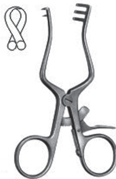
2584 WEITLANER Sharp 110 mm